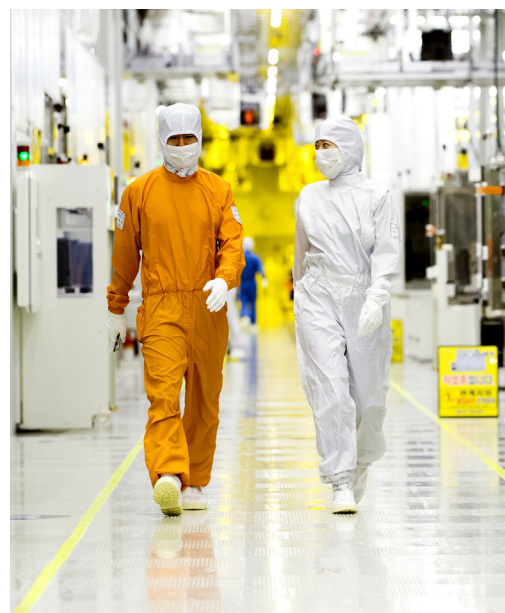
Samsung Austin Semiconductor is one of the most advanced fabrication facilities in the world.

5G LAUNCH SITE: Companies such as AT&T, Sprint, Verizon, T-Mobile and Samsung have rolled out 5G infrastructure in major metros across Texas. In 2018, Samsung partnered with AT&T to create America’s first manufacturing-focused 5G “Innovation Zone” in Austin to explore how 5G can impact the future of “Smart Factory” manufacturing. Leading IT service provider, Ericsson began manufacturing 5G equipment at its North Texas smart factory in early 2020.