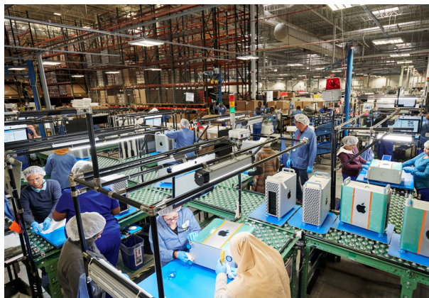
Apple's Mac Pro are assembled in Austin, Texas, in a facility that employs more than 500 people.

Long known as the manufacturing capital of the nation, Texas is where today's products are made and where tomorrow's technologies are brought to life. A testament to the state's incredibly diverse economy, Texas has supported strong manufacturing activity across a variety of industry sectors. The state's business-friendly environment, skilled and growing labor force and strategic location in North America have nurtured a thriving automotive manufacturing sector. In addition, Texas' extensive network of research and higher-education institutions have created an optimal environment for high-tech manufacturing, such as electronic components and aerospace and aviation products. Furthermore, the state's natural resources make it a key player in petroleum and chemical manufacturing and production. As the location of major operations for some of the nation's largest food and beverage companies, Texas is home to a robust food manufacturing sector. The Lone Star State is truly a manufacturing powerhouse.