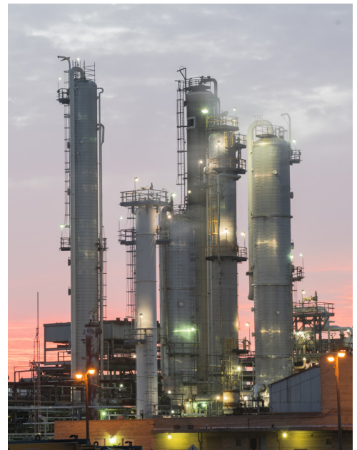
Petrochemical plant in Corpus Christi, Texas

Sources: U.S. Bureau of Economic Analysis and Texas Comptroller of Public Accounts