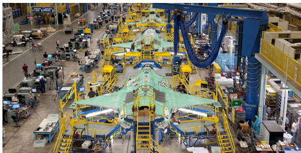
Lockheed Martin's assembly plant in Fort Worth, Texas, builds F-35 Joint Strike Fighters.

Texas has a long history in aerospace industry dominance and remains on the cutting edge of new developments and technologies. More than 50 years ago, NASA's Lyndon B. Johnson Space Center (JSC) was established in Houston. Since its inception, JSC has helped our nation achieve monumental breakthroughs in human space exploration. Today, Texas is home to state-of-the-art test sites for multiple commercial space firms and is leading the country towards the new frontier of aerospace and aviation innovation.