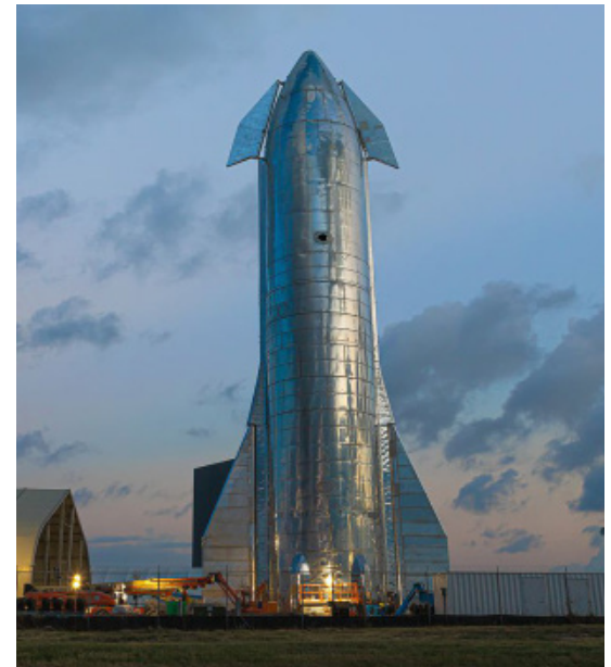
Starship at SpaceX launch facility in Cameron County, Texas.