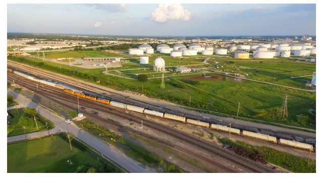
Aerial view of tank farm for bulk petroleum and gasoline storage next to rail line in Northeast Houston

As a national and global leader in energy, some of the largest energy companies are based in the Lone Star State. In fact, 23 energy-related Fortune 500 companies, including the headquarters for oil and gas giant Exxon Mobil, call Texas home. Texas is the nation's leading producer of oil, gas and wind energy, thanks in part to the state's ideal geography, available space, abundant natural resources, robust transportation systems and highly skilled labor force. To date, there has been more than $83 billion in capital investment in wind, solar and energy storage projects in Texas. An all-of-the-above energy strategy has led to continued growth across each of Texas' energy sectors. These sectors are not only important in fueling our state's economy but in helping our nation achieve energy independence.